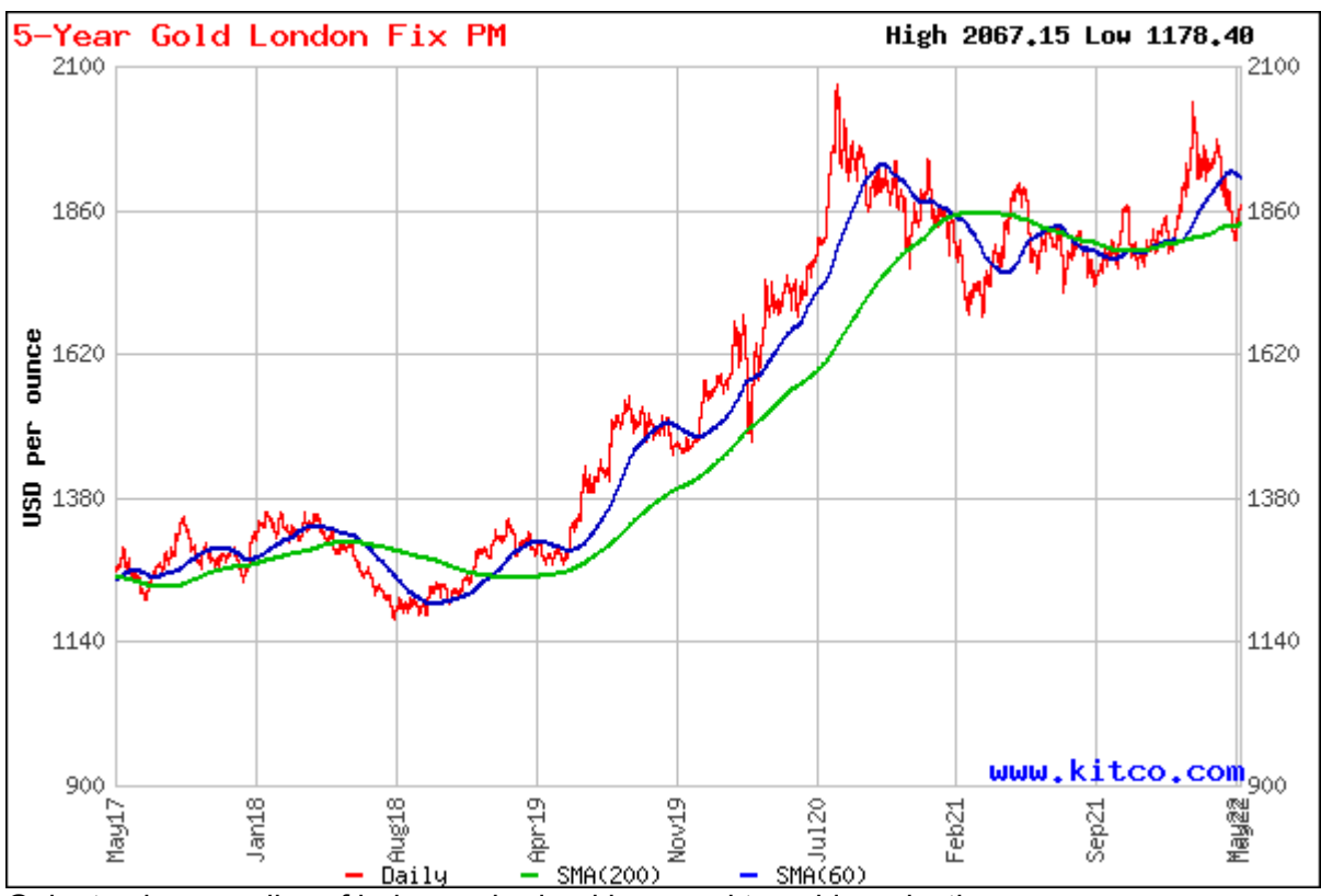
Galantas has a policy of being un-hedged in regard to gold production.

before subsequently falling back to above $ 1,900 by quarter end. Continued retrenchment had seen the price fall to the low USD$ 1700's by the end of the first quarter 2021. However, the final three quarters of 2021 have seen gold trade in the USD$1,700 to USD$1,800 range with strong upward pressure since the year end driving the gold price into the USD$1,800 to USD$2,000 range for the first 5 months of 2022.